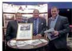
ACE pleased to support the CIU Clubs at the 2014 Conference and Exhibition

Re-upholstery and refurbishment work also carried out