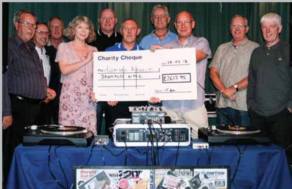
Members of Stanhill Working Mens Club present a cheque to a representative of Derian House Children's Hospice

Stanhill Working Mens Club in Oswaldtwistle, Lancashire, recently raised £2,613 for Derian House Children's Hospice, which looks after life-threatened children and young people from across the North West of England, as well as supporting their families.