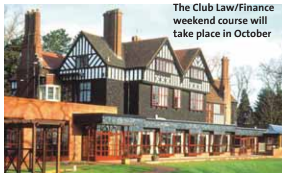
The Club Law/Finance weekend course will take place in October

Application forms may be obtained from your Club Secretary or the Leisure Department, Club & Institute Union, 253/254 Upper Street, London, N1 1RY. The forms can also be downloaded from the CIU website: www.wmciu.org.uk