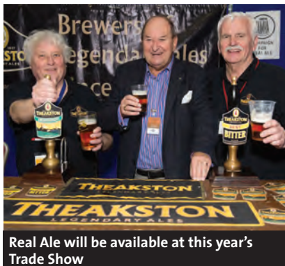
Real Ale will be available at this year's Trade Show