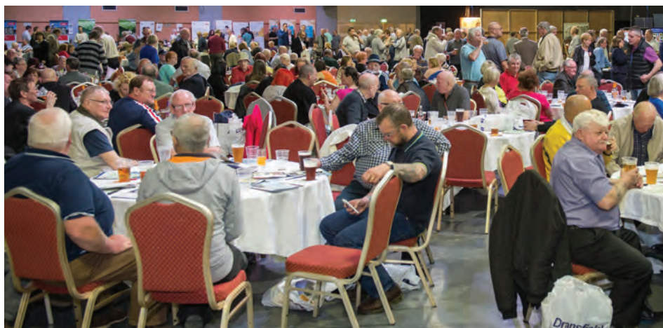
Members enjoyed a wide variety of activities during the 2015 Exhibition including bingo, pool, darts and the chance to participate in the Dransfields Grand Draw to win a 50-inch TV