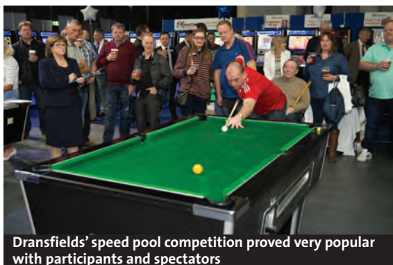
Dransfields' speed pool competition proved very popular with participants and spectators