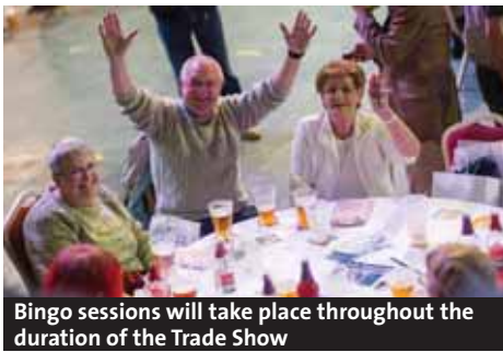
Bingo sessions will take place throughout the duration of the Trade Show