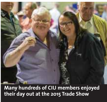
Many hundreds of CIU members enjoyed their day out at the 2015 Trade Show