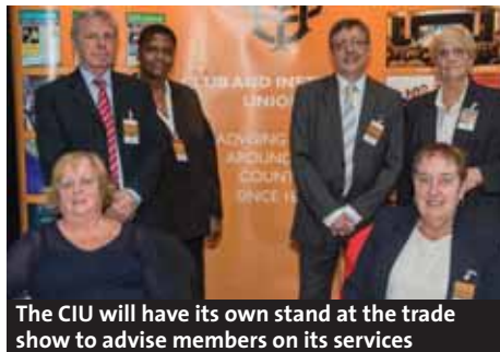
The CIU will have its own stand at the trade show to advise members on its services