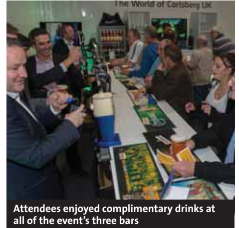
Attendees enjoyed complimentary drinks at all of the event's three bars