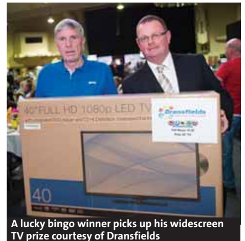
A lucky bingo winner picks up his widescreen TV prize courtesy of Dransfields