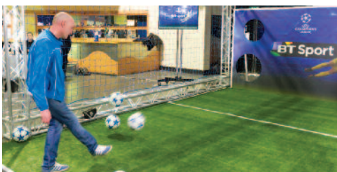
A delegate tries out his footballing skills on the BT Sport stand