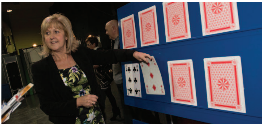
Delegates had the chance to 'play their cards right' and win prizes on the Dransfields stand during the 2016 show