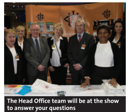
The Head Office team will be at the show to answer your questions